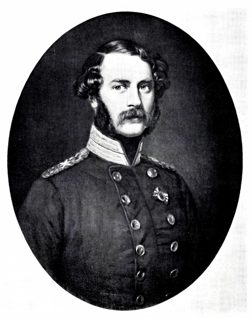
PRINCE CHRISTIAN OF GLÜCKSBURG (Christian IX) Painted by A. Schiøtt. 1853. Rosenborg Castle