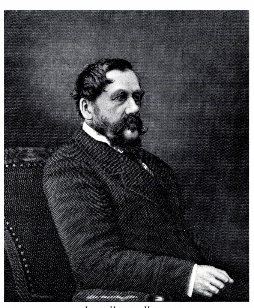
James Howard Harris Earl of Malmesbury (1807–1889) National Portrait Gallery, London.