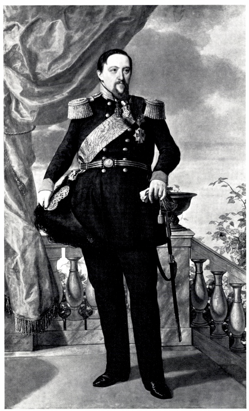
Frederik VII (1808–1863)

Painted by David Monies. It was presented by the King to Lord Westmorland. Bought in 1965 for the Museum of National History at Frederiksborg Castle.